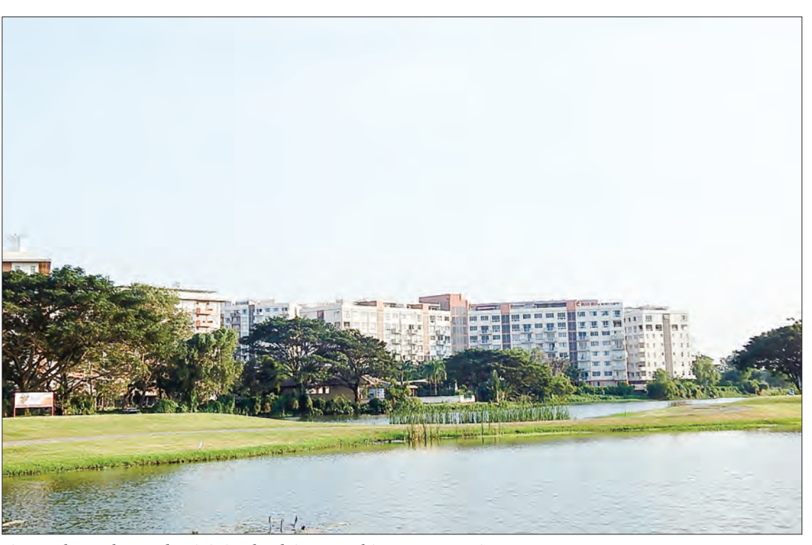
Picture shows the condominia in Thanlyin Township, Yangon Region.