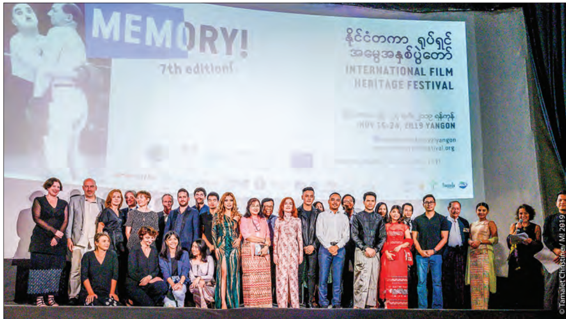
Opening Ceremony of MEMORY! International Film Festival at the Waziya Theatre in Yangon, Myanmar on Nov 15, 2019: In presence of the 2 patrons of MEMORY!, Isabelle Huppert (France) and Grace Swe Zin Htaik (Myanmar), alongside the prestigious Guests of Honour from Myanmar and abroad, including the MSF Jury.

Key international organizations of film industry have responded positively and will participate such as Cannes Festival Cinéfondation (France), Locarno Festival Open Doors (Switzerland), Rotterdam Festival Hubert Bals Fund (Netherlands), Cannes