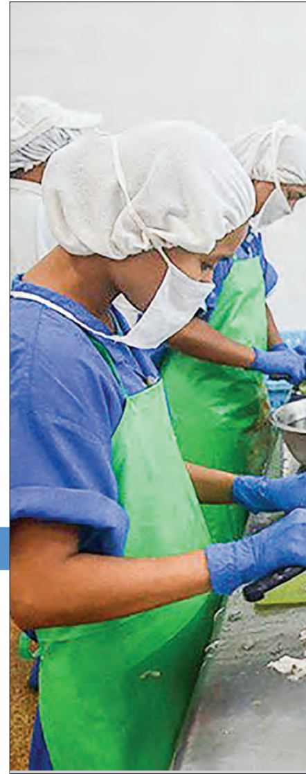
Workers process fish at a seafood factory

and international organizations related to fisheries in order to strengthen capacity building on improving fishery statistics collection and interpretation. The department is closely working with the fish breeders, processors and exporters to ensure Myan-