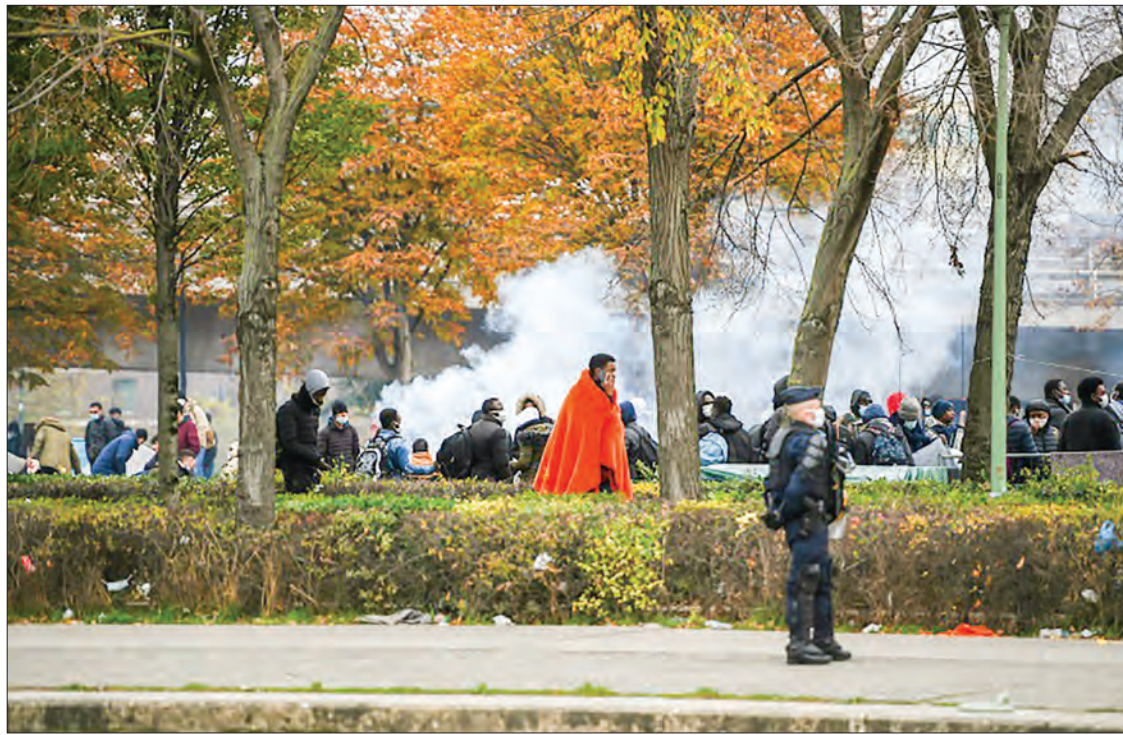
Dozens of police were deployed for the operation.

Paris is a key stop-off point on the European migrant route, with tented camps repeatedly sprouting up around the city only to be torn down by the police a few months later.