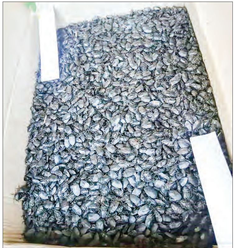
Rock-bugs are collected before sending to the market.