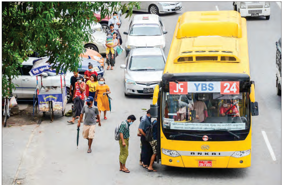
YBS buses are currently operating in Yangon region.

In such a pandemic period like this, YBS operates more than 2,700 buses from 106 bus lines, providing service for over 400,000 passengers in Yangon Region. Before the outbreak of COV-