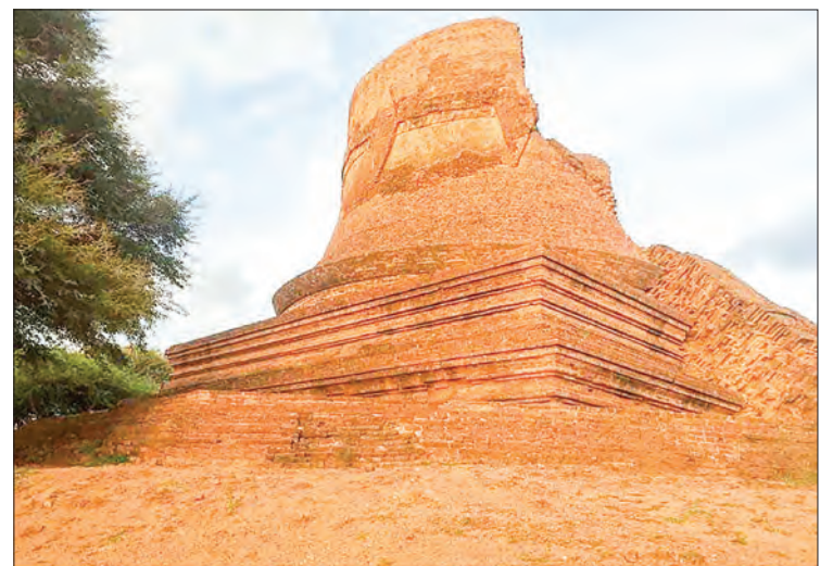
Kyauk Myat Maw (a two-level stupa) Pagoda.