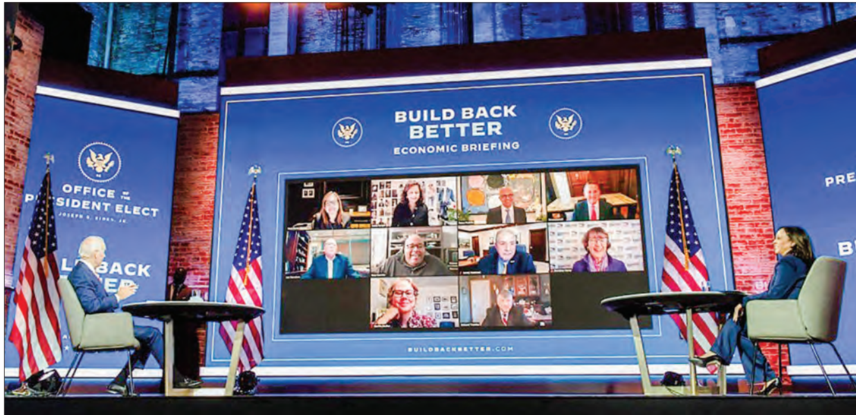
President-elect Joe Biden on Monday called for a new stimulus package to help the United States recover from the damage caused by coronavirus pandemic.

PRESIDENT-ELECT Joe Biden on Monday called for a new stimulus package to help the United States recover from the damage caused by coronavirus pandemic.