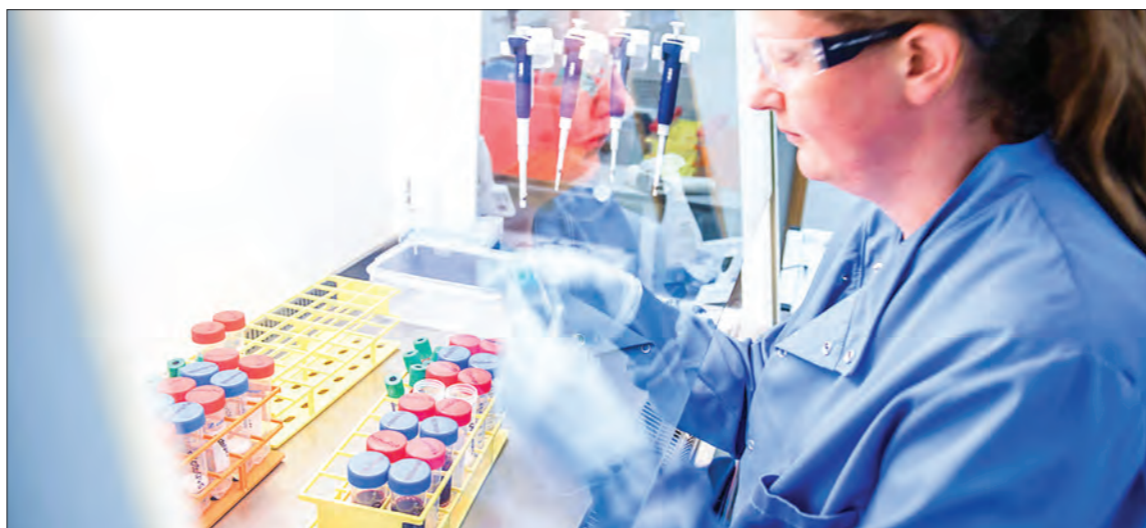
Samples are tested by scientists at Oxford University's Jenner Institute as the development of a vaccine against the coronavirus continues.

This follows a recent similar announcement by pharmaceutical companies Pfizer and BioNTech.