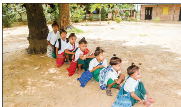
NyaungU children with traditional topknot hairstyle.

It is about 1 mile 7 furlongs from NyaungU to Tu Yin Taung. It is just a trekking tour which lasts about 30 minutes from a monastery located on Tu Yin Taung. It is convenient for those like trekking. Kyauk Yay Kan is 80 ft in length, 80 ft in width and about 30 ft in depth and it is a strange lake of Tu Yin Taung. There is Mya Kan in the west and ancient Bagan pagodas, Ayeyawady river and Tant Kyi Taung in the north-west of Kyauk Yay Kan. These places are the new tour sites which garner the interest of local and foreign tourists most.