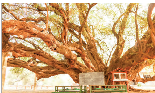
A 900-year-old tamarind tree in Zee O Village.

The Kyauk Myat Maw pagoda is located beside the Ayeyawady riverbank in the southern part of Myin Ka Bar village near the Soe Myin Gyi pagoda. The pagoda is in two-level structure on the same plinth, and the inner part bears octagonal structure with artworks of the Pyu era. The outside and inner parts of the pagoda are separated with pillars which are about 3 ft in width. According to the archaeologists, the pagoda was constructed at about 12-13 century AD. This site also attracts the interest of tourists with its stunning views of the sunset at Ayeyawady river and iconic views of Tant Kyi Taung. —Pe Lain (Bagan) (Translated by Khine Thazin Han)