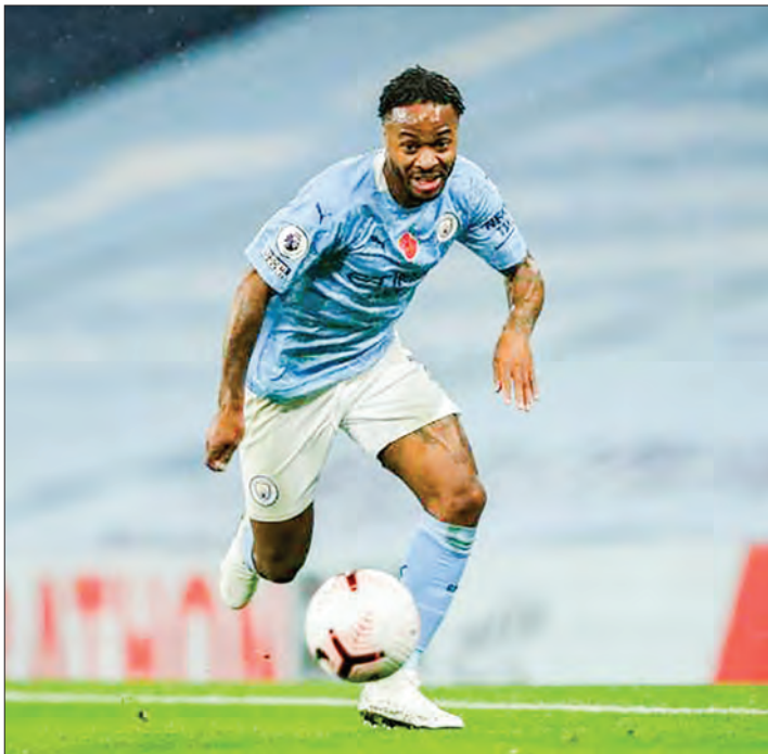
Iceland absentee- Manchester City's Raheem Sterling will miss England's final game of 2020.

England manager Gareth Southgate will now continue his preparations for his side's final game of the year with a 22-man squad.—AFP ■