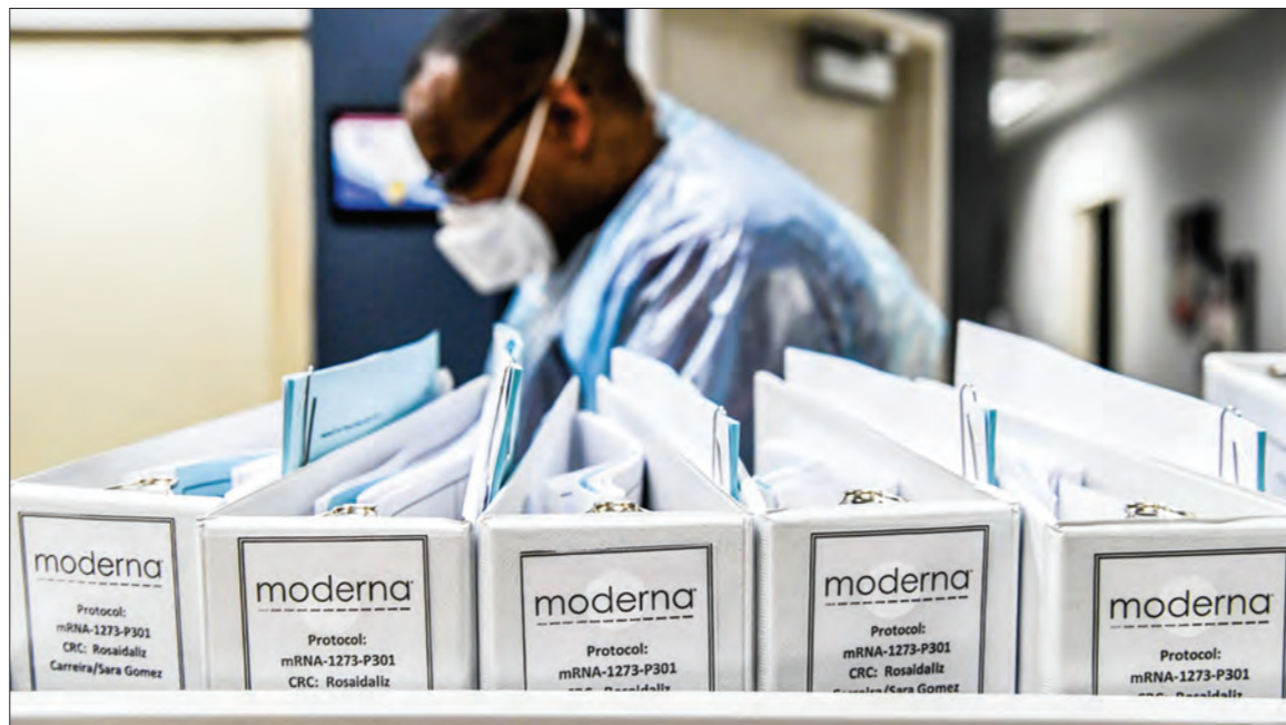
Documents from the Moderna Research Centre of America, in Hollywood, Florida, on August 13, 2020.

"It is really a spectacular result that I don't think anybody had