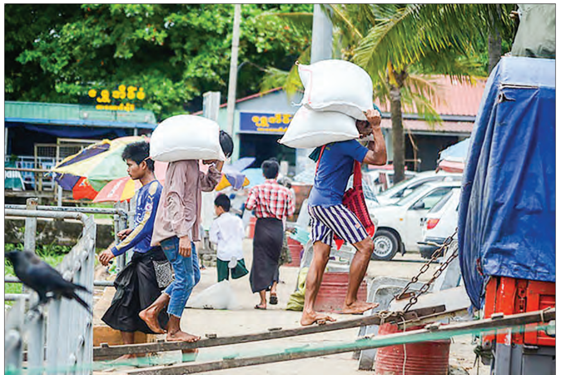
Workers load sacks of rice onto a truck in Yangon.

Myanmar shipped 3.6 million tonnes of rice in the FY2017-2018, which was an all-time record in rice exports. The export volume plunged to 2.3 million tonnes, in the FY2018-2019. —Ko Khant (Translated by Ei Myat Mon)