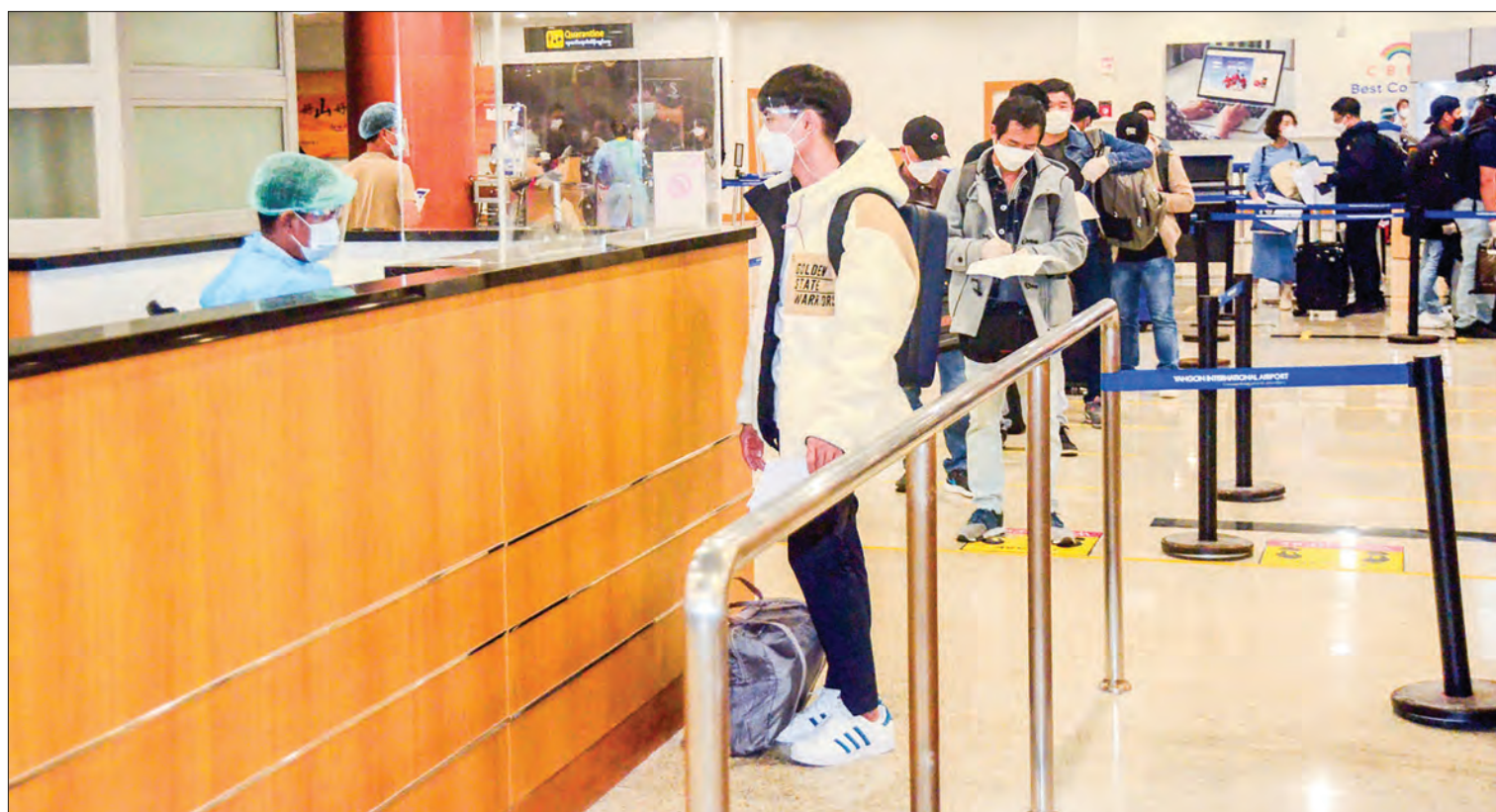
Myanmar returnees are seen at Yangon International Airport on 17 November.

The Ministry of Labour, Immigration and Population, the Ministry of Health and Sports and the Yangon Region government arranged 7-day quarantine at specific places or designated hotels, followed by the 7-day home quarantine.