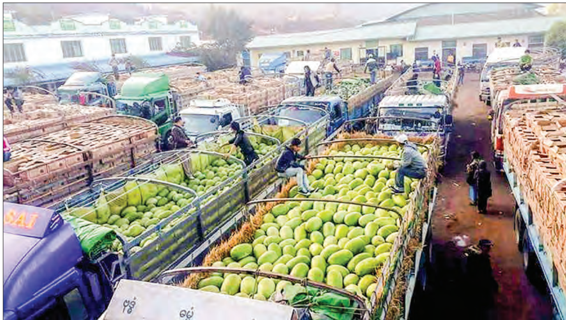
Watermelon are seen ready to export to China.