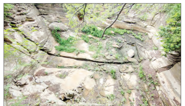
Bird-eye view of Stone Lake (Kyauk Yay Kan).