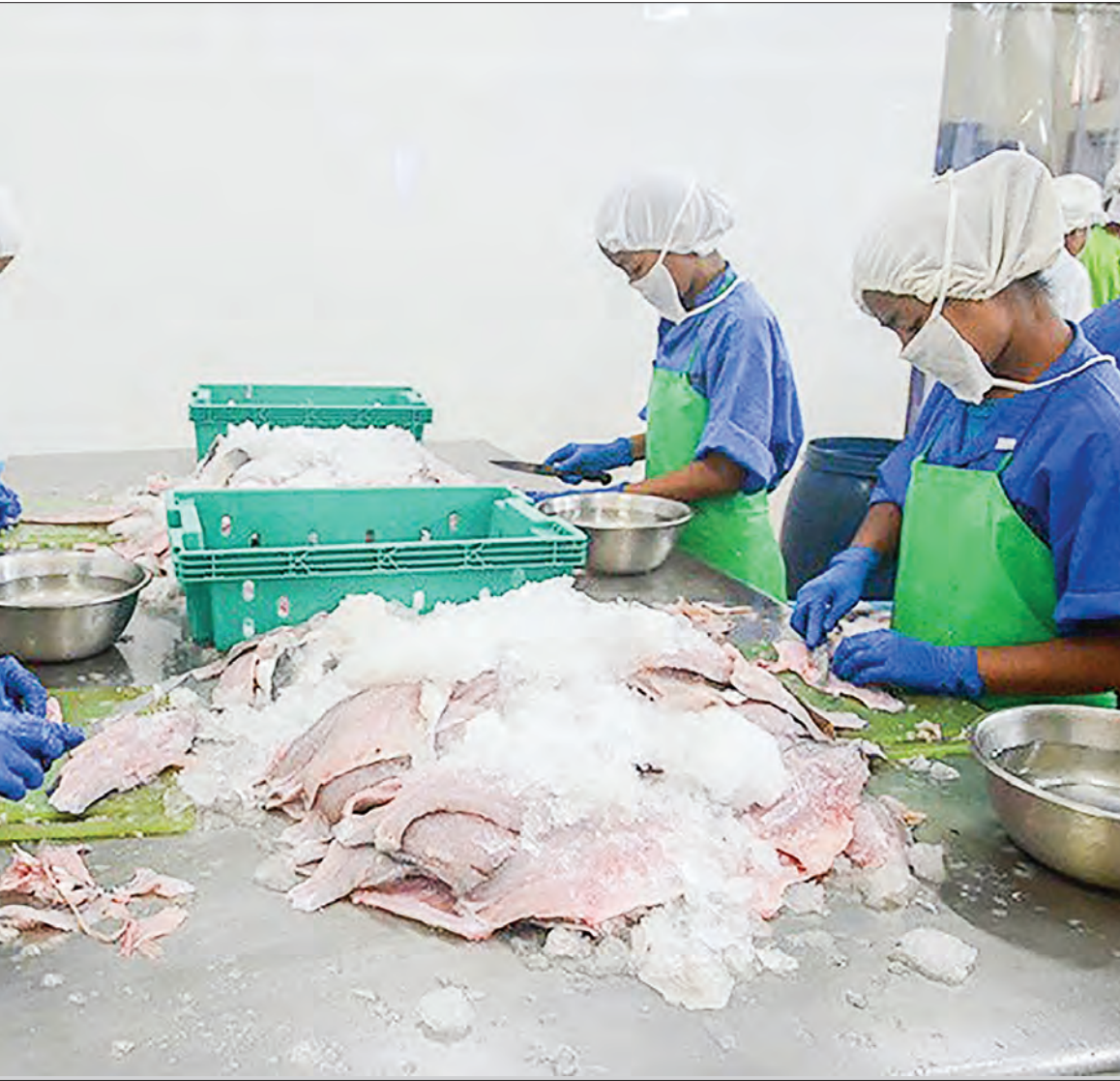
ry on the outskirts of Yangon.

mar marine products meet the rules and regulations of importing countries. At the same time, fishery officials are trying utmost to conserve fishery resources as well as ensure sustainable development in the country's fishery sector.