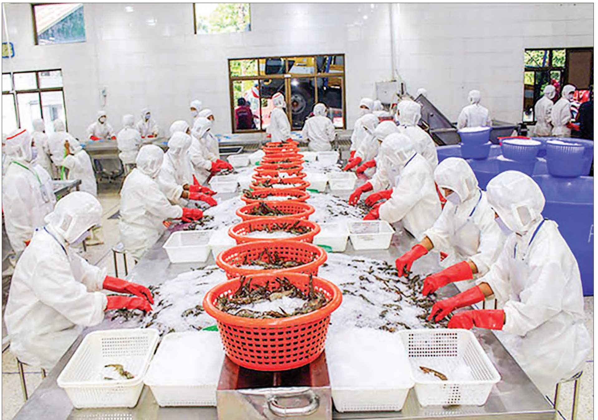
Workers seen at a seafood processing factory in Kawthoung, Taninthayi Region.