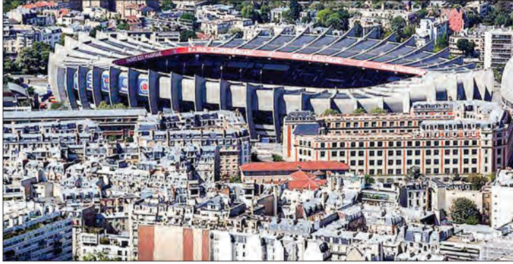
Fans will not be allowed to return to French stadiums to watch sporting matches before January, and then with strict crowd limits depending on a venue's size, the French presidency said Tuesday.

PARIS — Fans will not be allowed to return to French stadiums to watch sporting matches before January, and then with strict crowd limits depending on a venue's size, the French presidency said Tuesday.