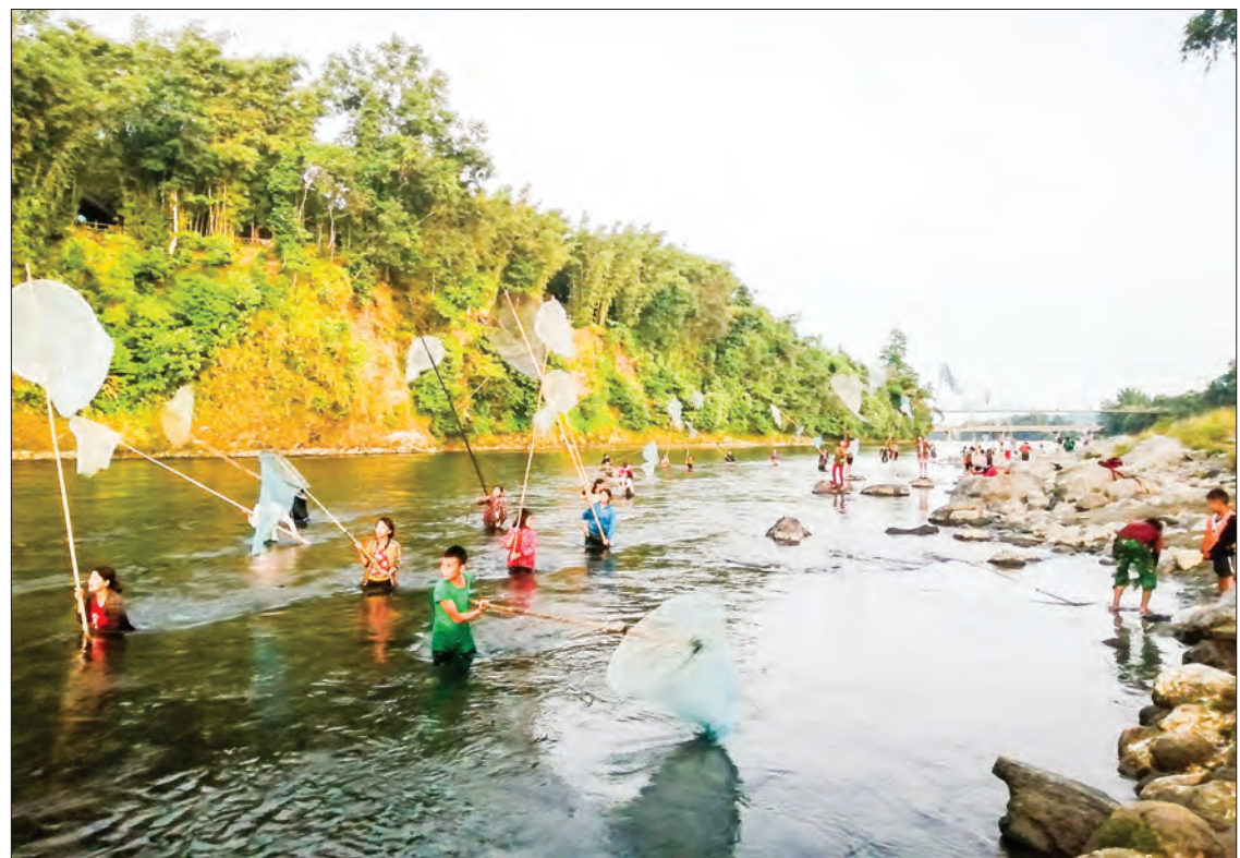
Rock-bug hunters are seen in a creek near Putao.

A genus of Kyaukyapo insects found only from November to March in Putao has two types as in small and large species this year. For the large one, the price is up to 50,000 kyats per viss whereas, for the small one, the price is up to 90,000 kyats per viss.