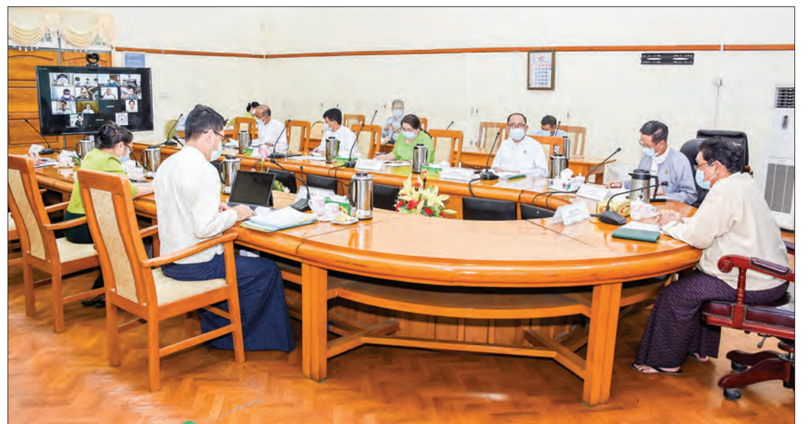
MoC holds virtual coordination meeting on freight transport, mushroom farming on 17 November

Deputy Minister for Commerce talked about the further discussion to enhance the land trade with China and Thailand despite restrictions, the establishment of Cold Storage, Packing House and Logistic Commodity Exchange Centre to ease the trade flows, robust relations between economic attache's and traders and creating markets for the mushroom which is being