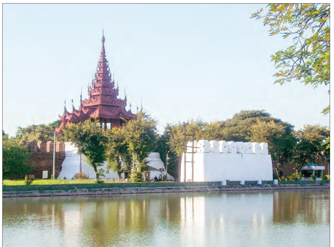
Mandalay Royal Wall attractive to both locals and foreigners.