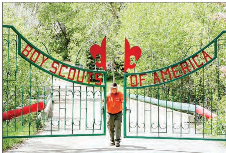
Revelations of misconduct in the Boy Scouts of America came to widespread attention in 2012 when the Los Angeles Times published internal documents spelling out details of decades of sexual abuse.