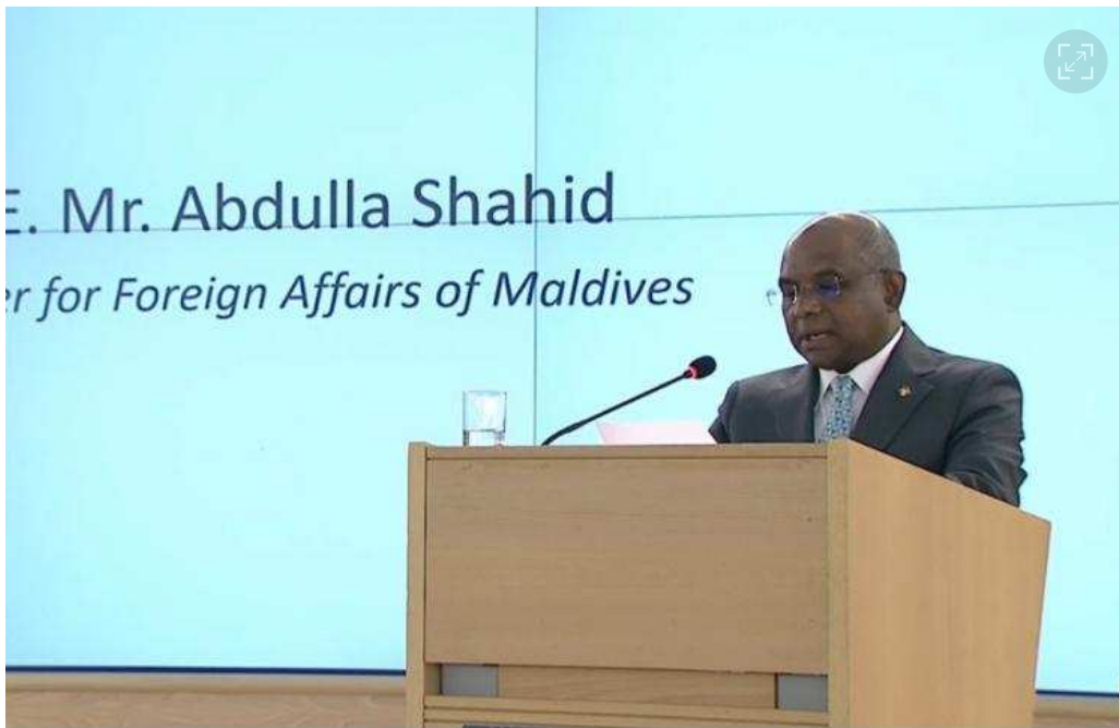
Foreign Minister Abdulla Shahid delivers his statement at the 43rd Session of the UN Human Rights Council in Geneva.

Minister of Foreign Affairs Abdulla Shahid announced the Maldivian administration's decision to file a written declaration of intervention at the International Court of Justice (ICJ) at The Hague, in support of the persecuted Rohingya people.