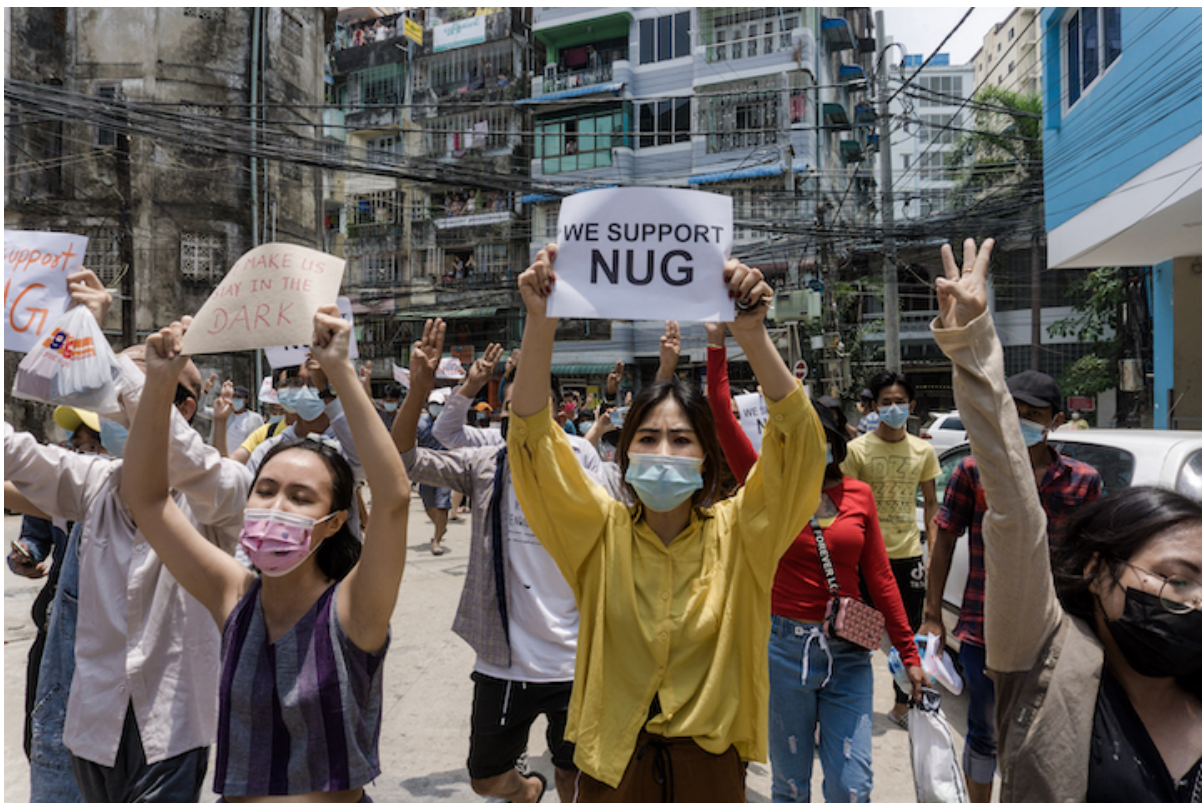
Protesters hold signs in support of the National Unity Government (NUG) during a demonstration against the military coup in Yangon's Sanchaung township on 27 April 2021.